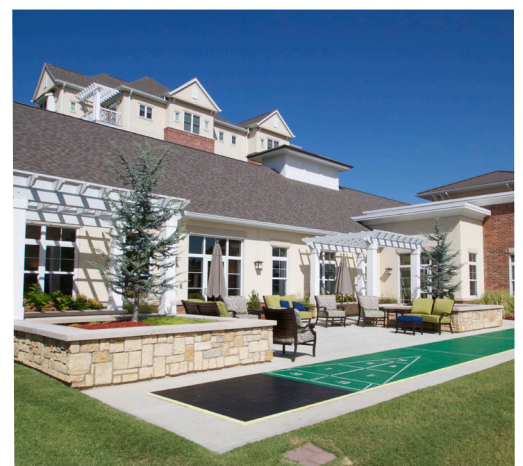
Spann Wellness Center

The POE findings incorporate resident, staff and management feedback of successful design implementation and recommendations for future improvements throughout the campus. Some areas for future improvement include: additional programming consideration for pre-function spaces and outdoor space utilization, surveying of residents to optimize usage and flow in the Spann Wellness Center, ensuring adequate back of house spaces for staff and incorporating additional storage for future occupancy.