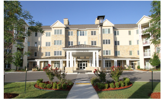
Crestwood Independent Living

The OMM final site plan, design solutions and phased construction has positioned the campus as the leading mid-priced option for residents looking for a CCRC in the Tulsa area. OMM has experienced a significant positive financial impact from the holistic product offering and is currently looking towards ways to continuously update their campus to remain the leading provider in the area.